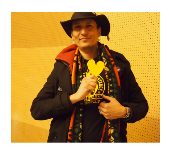
In memory of Klee Benally .

Navajo / Diné artist, activist and filmmaker. We are honoured that he created the poster and t-shirt designs of the International Uranium Film Festival tours in USA in 2018 and 2024.